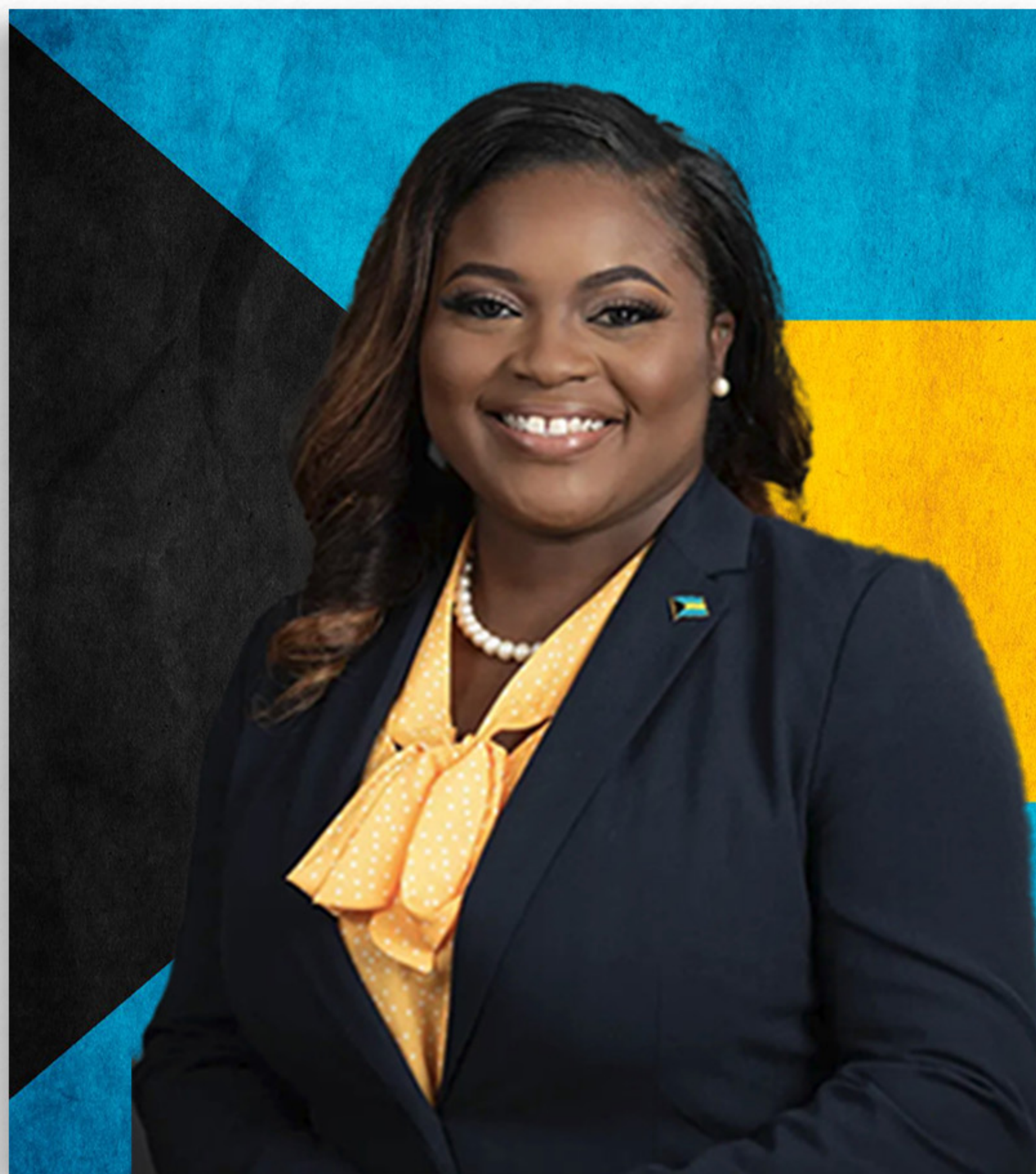
Hon. JoBeth Coleby-Davis, Minister of Housing and Transport for The Bahamas.

"We are also focused on encouraging renewable industries. During my term in office, we have provided increased support to The Bahamas Maritime Authority and forged stronger relationships with our